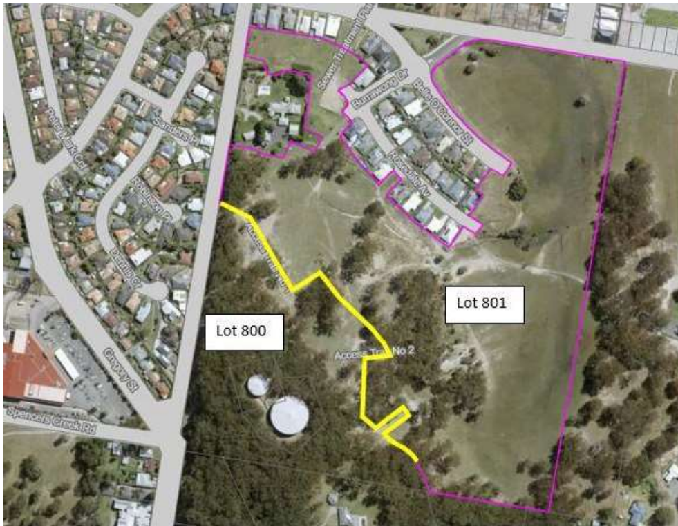
Figure 1: Subject site boundary in purple with area subject of mapping realignment in yellow

The issue to be resolved by this planning proposal is that the KLEP2013 mapping layers (land zone, lot size, height of buildings and scenic protection land) do not align with the boundary dividing lot 801 from 800 (as illustrated in Figure 2 below).